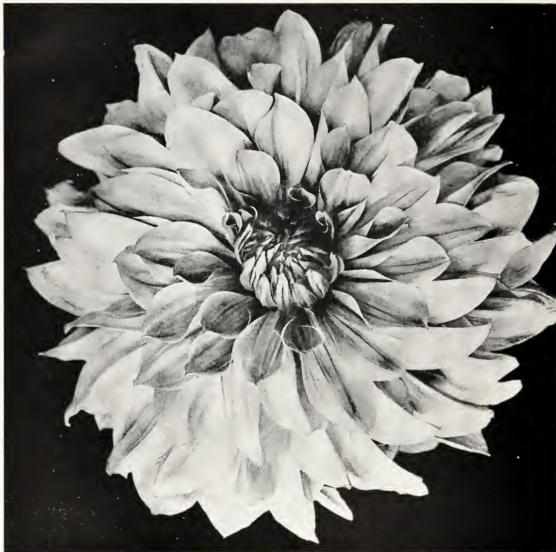
Glenn Felt—(Our Introduction) Decorative Dahlia, see page 11.

JEAN CHAZOT OR GAY PAREE —Cac. A wonderful French dahlia. One of the best of commercial bronze or autumnal shades we grow. Is a very free bloomer and has long straight stems holding the flower well above the foliage. Our meagre description cannot picture to you the full beauty of this flower. It is of great size and unusual depth..... .50